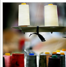
The City: Garment District Woes