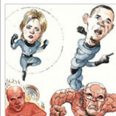
Frank Rich: Who's Afraid of Barack Obama?